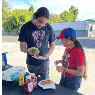
ELLIOTT EDUCATION CENTER