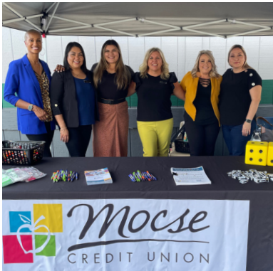
MOCSE CREDIT UNION

One of these partnerships is between Elliott Education Center, Redeemer Church, and MOCSE Credit Union. Recently MOCSE and Redeemer planned a Back to School event in which students and families enjoyed a BBQ dinner and free backpacks were passed out!